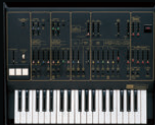
ARP Odyssey Rev2