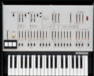
ARP Odyssey Rev1

The ARP Odyssey's signal path had a major impact on synthesizer manufacturers that followed. It became the standard for subsequent eras, influencing even the polyphonic and digital synthesizers that were to come later.