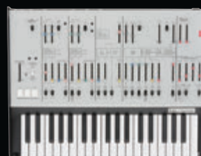
ARP ODYSSEY Rev1 (limited-edition model)

Of the various designs that differed by production date, the ARP ODYSSEY uses the Rev3 design with a black panel silk-screened in orange. The white-paneled Rev1 and the black panel with gold-printed Rev2 designs have also been revived as limited-edition models. If you're an original user, you can choose the design that brings back those fond memories; if you're a new user, choose the model that you like best.