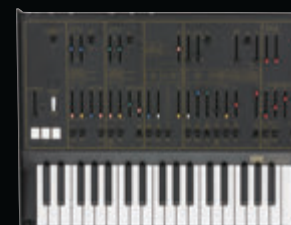
ARP ODYSSEY Rev2 (limited-edition model)