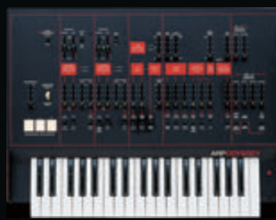
ARP Odyssey Rev3