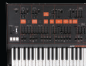
ARP ODYSSEY (standard model)